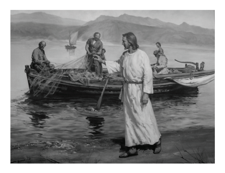
Waiting for Thy <u>promised</u> earthly Kingdom to come with its Restitution of <u>all things.</u>

The world, for whom Christ died (John 3:16), is about to embark on an Age which will realize all humanity's deepest longings. Romans 8:20, 22; Isaiah 25:9