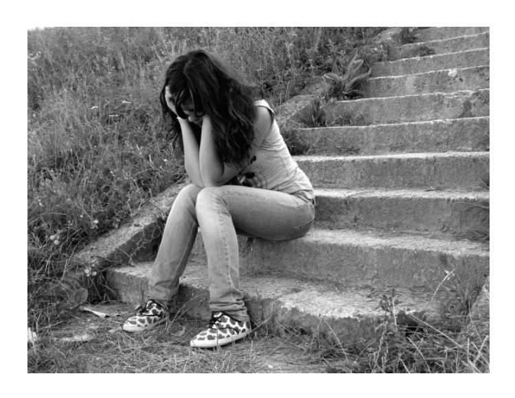
Waiting for Thy <u>promised</u> earthly Kingdom to come with its Restitution of all things.

"For the creation [world of mankind] waits with eager longing for the revealing of the sons of God; for the creation was subjected to futility, not of its own will but by the will of him who subjected it in hope; because the creation itself will be set free from its bondage to decay and obtain the glorious liberty of the children of God." Romans 8:19-21 (RSV)